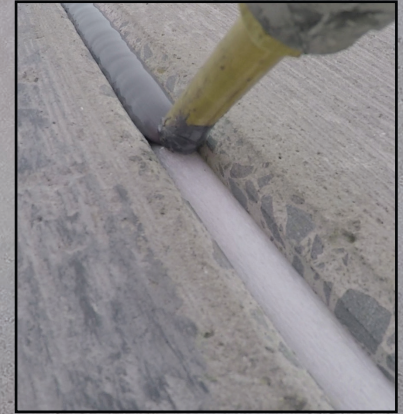
RoadSaver Self-Leveling Silicone Sealant

Independently Proven to Perform for 21+ Years